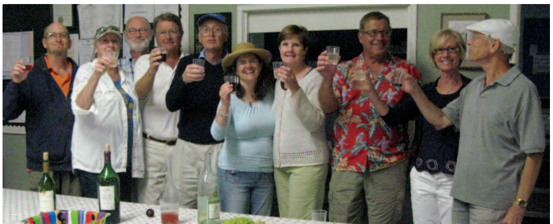
The winners and Tournament Directors were honored at the end of the last day of the Friday Night League.